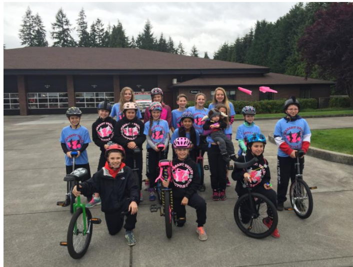
Congratulations to the PVM Marching Band and the Pleasant Valley Unicycle Team on their outstanding performance in the Hazel Dell Parade.